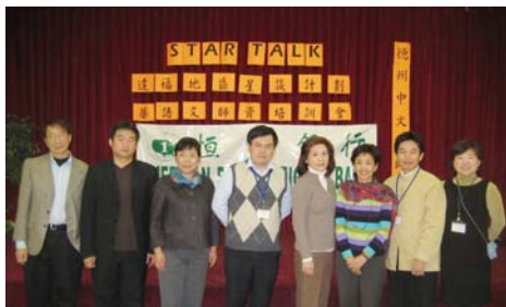
Dallas-Ft. Worth Chinese Teacher Workshop