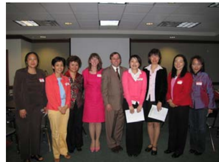
Greater Austin Language Teachers