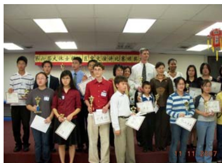
Speech winners of non-heritage groups

CLTA-TX organized a committee to arrange the Greater Houston Youth Chinese Speech Contest on November 11, 2007. Approximately 180 young learners competed at different levels at the Chinese Civic Center.