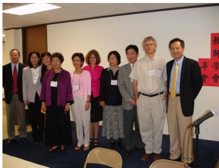
CLTA-TX Board at the annual meeting