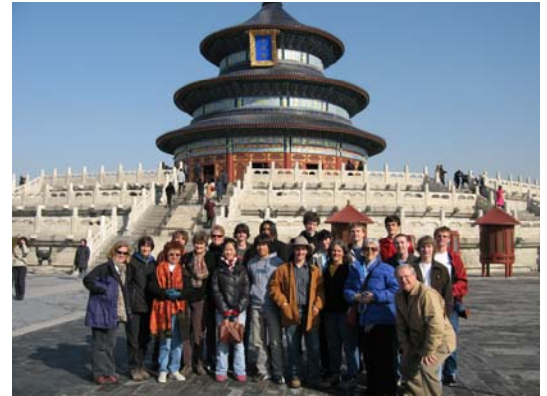
SSES students in Beijing